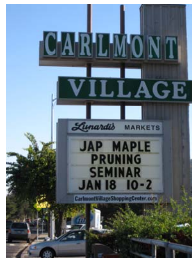
Carlmont Village Shopping Center in Belmont, California.

National Office - January 2009: The National JACL responded to what appeared to be a pattern of perpetuating racial stereotypes of Asian Americans on the Stephanie Miller show. The show presents a Kim Jong-Il character, voiced by Jim Ward, in which he transposes the letter "r" with "l" in speech, and uses the song "We Have to Celebrate Our Differences" that includes the lines "ching-chong" and "ugga-booga." In a letter to the show's executive