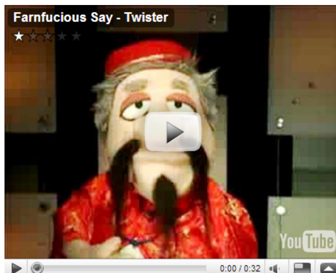
One of many episodes of “Farnfucious Say.”