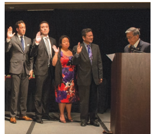
The 2017-2018 JACL National Board is sworn into office

The 48th JACL National Convention will be held in 2017 in Washington, DC.