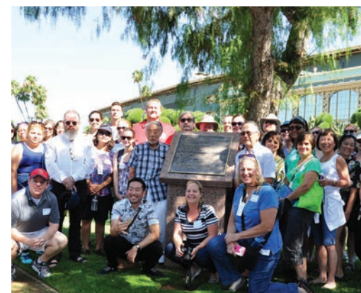
Teachers pose with plaque commemorating the Santa Anita Detention Center