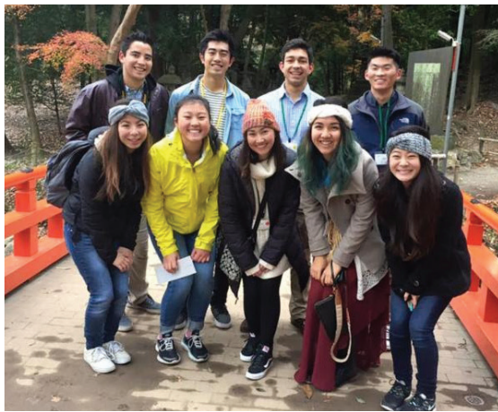
The 2016 Kakehashi Participants in Japan

In 2015-2016, the JACL sent 185 participants in December 2015, January 2016 and March 2016 to Tokyo, Kyoto, Fukuoka, and Miyagi prefecture.