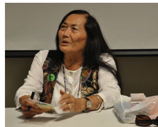
"Farewell to Manzanar" author Jeanne Wakatsuki Houston at a workshop