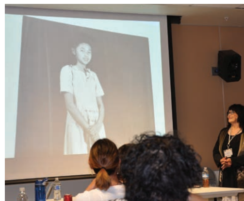
NEH workshop facilitators give a presentation

as facilitators. They also assisted the teachers who collaborated on a project to develop learning activities to be used in their classrooms.